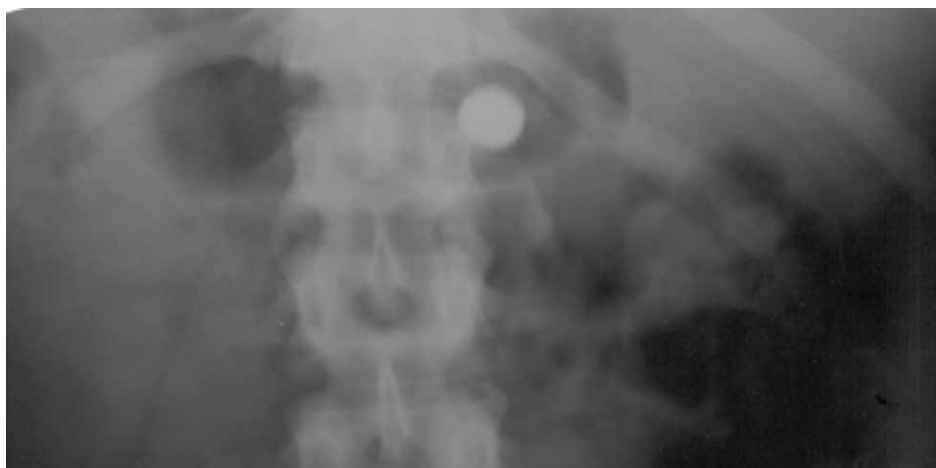
Fig. 2. X-ray radiogram of abdomen 6 h after ingestion of optimized placebo BFT formulation.

b Mean ± SD, n = 6 (floating and drug content studies), n = 10 (hardness test).