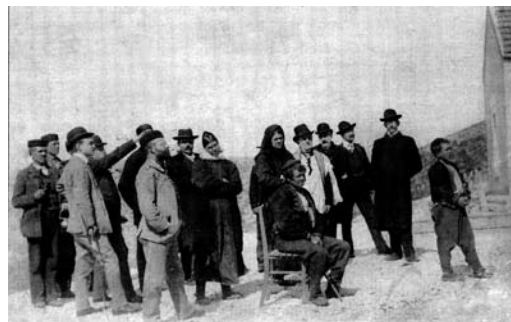
Figure 2. Opening ceremony of the leprosarium on March 15, 1905.

The leprosarium was opened on March 15, 1905 and this event was well covered in contemporary newspapers, showing the significance of the newly opened institution for the public (Figure 2). Dr Karl Vipauc (1851-1950), who was the regional health supervisor for Dalmatia, personal-