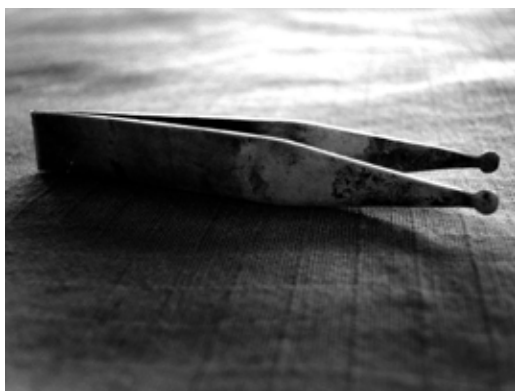
Figure 4. Tweezers which were used by the priest during the Holy mass to give the communion to the lepers.

isolated in the leprosarium during its existence, most likely the members of three families (Sentić, Ilić, and Milinković).