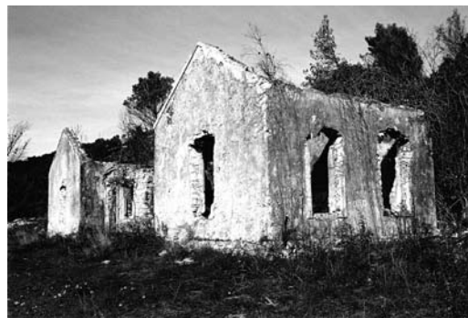
Figure 7. Remains of the “Lepers’ houses.”

After that, the complex was neglected and left to slowly dilapidate. After the closing of the leprosarium, no single case of leprosy was documented, so it could be concluded that in 1925 leprosy was eradicated in southern Croatia. Today as a reminder of the last leprosarium in Croatia, we have only the ruins surrounded with the dense vegetation and the toponym “Lepers’ houses,” well rooted in the local population (Figure 7).