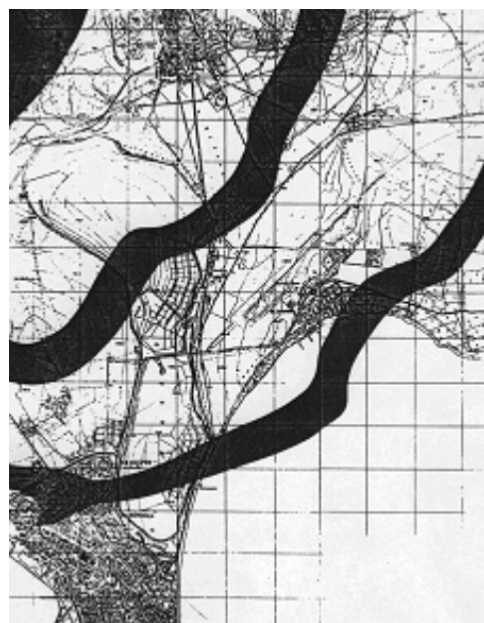
Figure 2 Noise outlines near to Airport Bourgas in L_{Aeq} , dB(A), 8 hours (22.00-06.00 h), for an busy summer night (outside line correspond to L_{Aeq} = 50 dB(A))

equivalent noise level) limits [daytime - L_{eq} < 60 dB(A); night - L_{eq} < 50 dB(A)] in the summer and winter, respectively. Sonic discomfort affects relatively more people at night than during the day. An investigation of basic vegetative functions under exposure to noise during sleep has shown significant deviations in the pulse, blood pressure, and electroencephalography (18, 19).