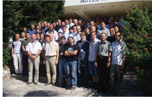
Slika 1. Sudionici konferencije ECMR09 ispred hotela Astarea

ECMR se održava svake druge godine, počevši od prve konferencije koja je održana 2003. godine u Radziejowiceama, Poljskoj. Druga je konferencija održana 2005. u Anconi u Italiji, a treća 2007. u Freiburgu u Njemačkoj. Sjedeća, peta, konferencija održat će se 2011. u Örebro u Švedskoj. Glavni je cilj održavanja ECMR konferencija uspostava Europskog foruma, koji je otvoren i za istraživače izvan Europe, na kojemu europski znanstvenici iz područja mobilne robotike razmjenjuju svoja postignuća u području autonomne navigacije mobilnih robota i njihove interakcije s ljudima. Posebno se potiče sudjelovanje mladih znanstvenika koji dobivaju prigodu prezentirati svoje rezultate i o njima raspravljati s kolegama koji se bave vrlo srodnim problemima. Kako bi se ovi ciljevi ostvarili, ECMR konferencija se odvija u jednoj sekciji tako da svi sudionici prate sve prezentacije.