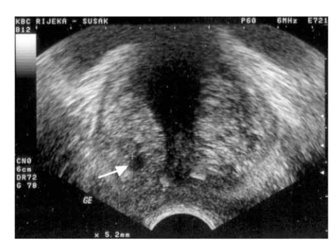
Fig. 3. Transrectal sonography showing a hipoechoic prostate cancer lesion (arrow) in the peripheral zone of the right prostatic lobe