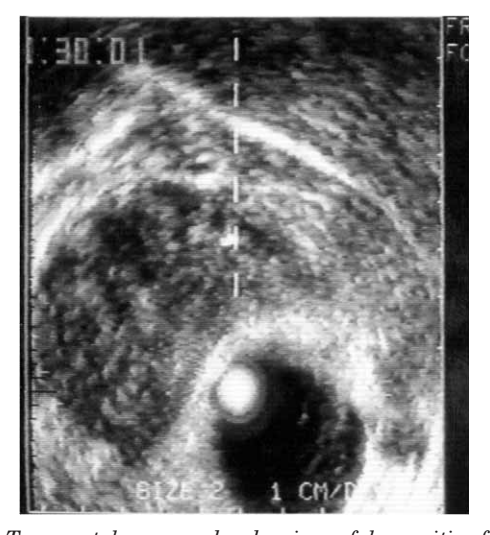
Fig. 2. Transrectal sonography showing a false positive finding in chronic prostatitis.

In the first period by TRUS we have made an exact diagnosis of prostate cancer (Figure 1) in 18.97% (107) of patients what was confirmed by biopsy. 4.61% (26) ware false positive (Figure 2) and 11.34% (64) ware false negative. In the second period prostate cancer was recognized in 30.34% (1723) of patients, confirmed by biopsy. False positive cases ware 6.11% (347) and false negative 29.31% (1664). Sensitivity of transrectal sonography in the first period was 62.57%, specificity 94.2%, accuracy 86.2%, positive predictive value 80.45% and negative predictive value 87.72%. In the second period sensitivity was 50.87%, specificity 91.93%, accuracy 73.84%, positive predictive value 83.24% and negative predictive value 70.39%. Based on our experience prostate cancer is mostly found in the peripheral zone (Figure 3). Smaller tumors are hipoechoic and bigger tumors are hiperechoic.