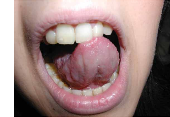
Fig. 3. Complete remission of lesions on the ventral side of tongue in patient with pyostomatitis vegetans after adalimumab therapy was started (compare with Fig. 1.).

Case 2. A 32-year-old woman with history of UC presented with yellowish, slightly elevated, pustules on the erythematous soft palatal mucosa and mucosa of the dorsal side of tongue (Figure 4) which occurred after stopping corticosteroid therapy. The patient complained of severe pain, which interfered with food ingestion. Histological examination of a biopsy specimen removed from the dorsal side of tongue showed intraepithelial and subepithelial exudates containing numerous granulocytes