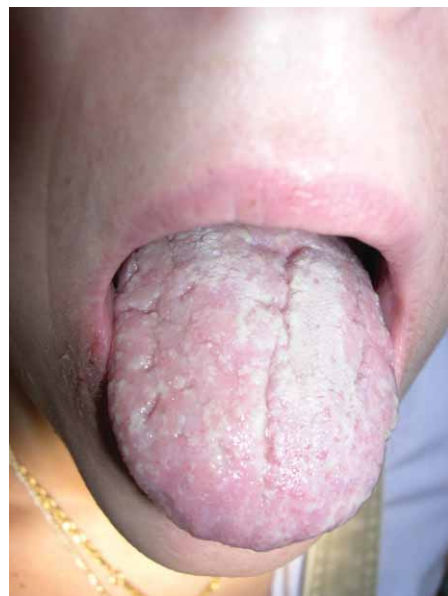
Fig. 4. Oral findings in patient with pyostomatitis vegetans and ulcerative colitis – pustules and fissures on the dorsal side of tongue.