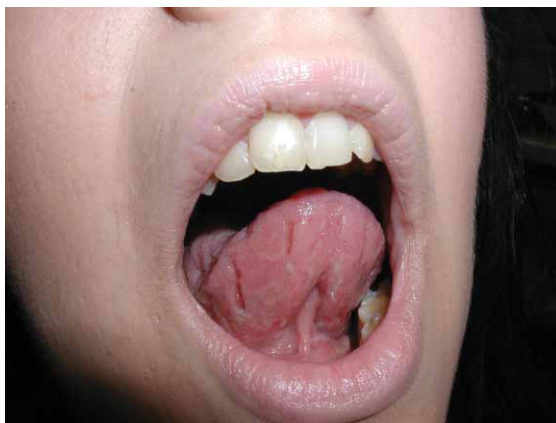
Fig. 1. Oral findings in patient with pyostomatitis vegetans and Crohn's disease – deep fissures on the ventral side of tongue.

Pyostomatitis vegetans (PV) is a rare chronic mucocutaneous disorder 1-3 . PV was first reported by Hal-