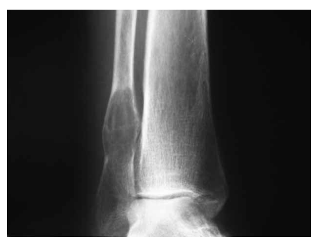
Fig. 2. Ostheolithic lesions of the distal part of fibula.

fected region of fibula (some 7–8 cm from malleolus). The affected region of the bone was supplemented with the graft from iliac bone, with the use of plates and screws. The conclusion of this procedure was that further tissue samples were needed, since the previous ones were not of sufficient quality for a definitive diagnosis to be set.