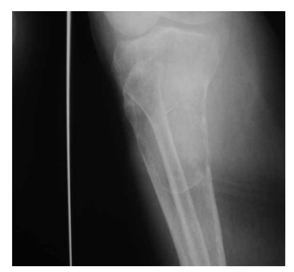
Fig. 5. Proximal tibial fracture where lesion was previously described.

Few days later, the patient was admitted for the third time, due to poor healing results of the tibial fracture. This resulted in the subsequent surgical approach, where two condilar plates were merged. Laboratory results suggested hypercalcaemia and elevated PTH level; calcium 3.82 mmol/L (lab range up to 2.6 mmol/L), PTH 751 pg/mL (lab range 10-69 pg/mL). Thyroid scan suggested adenoma of the lower right parathyroid gland. Following that, the histological results were available, suggesting gigantocellular tumor or an aneurismic cyst, albeit without a strong confirmation. In August, the patient underwent adenectomy of the right parathyroid gland, but the post-operative histological result suggested incomplete removal. The subsequent lab findings were in September PTH 738 pg/mL, Ca 3.35 mmol/L, P 0.69 mmol/L, while in October PTH was 1156 pg/mL, Ca 3.84~\mathrm{mmol/L}, P0.67mmol/L (lab range 0.7-1.4 mmol/L; Table 1). Finally, in October the adenoma was removed using Gamma camera guidance.