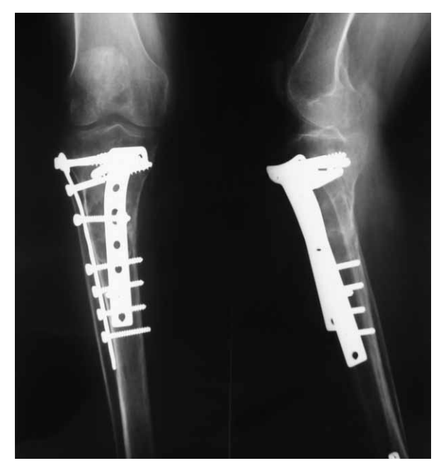
Fig. 8. Tibial fracture where the lesion was previously described, stabilized with two condilar plates. The lesion is gone, while the progression is satisfactory.

agnosed in an advanced state. Additionally, the diagnosis is usually set after half of year or so, which can lead to the number of various complications and fractures. This is why calcium should be included in the differential diagnosis of the ostheolithic changes, leading to the faster definitive diagnosis setting. Besides the primary hyper-