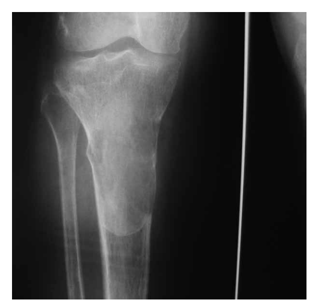
Fig. 4. Proximal tibial fracture where lesion was previously described.