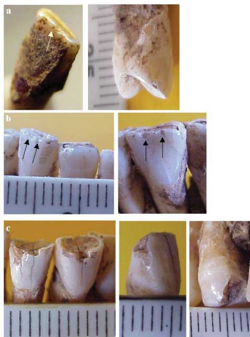
Fig. 2. Chipping scale. a) grade 1; b) grade 2; c) grade 3 (from Bonfiglioli et al. »Masticatory and non-masticatory dental modifications in the Epipaleolithic necropolis of Taforalt (Morocco)« Int. J. Osteoarchaeol. , in press).

for any reason that makes it impossible to record the trait.