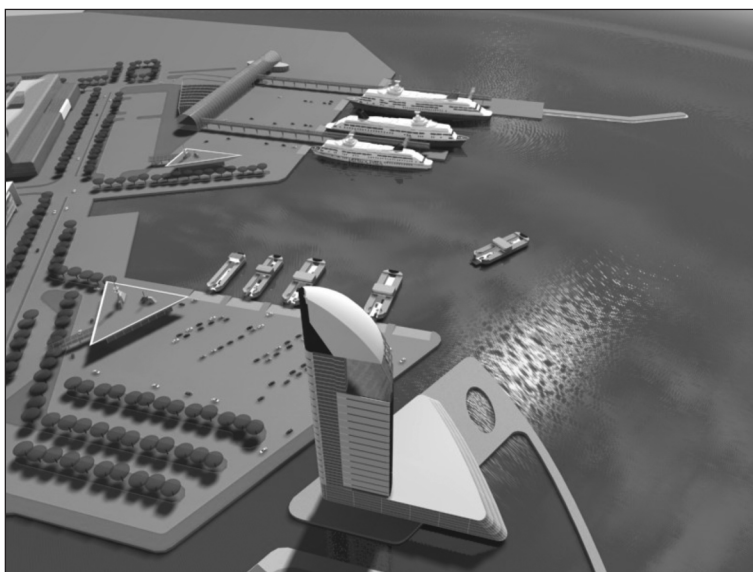
Drawing 1. Image of modern multipurpose passenger terminal