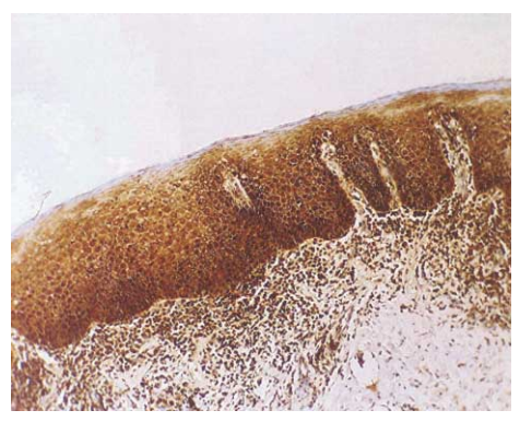
Fig. 2. Oral lichen ruber (OLR). Positive immunohistochemical reaction of the PCNA antigen in oral epithelium. High intensity reaction in lamina propria (LSAB ×200).