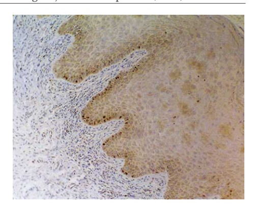
Fig. 4. Oral lichen ruber (OLR). Positive immunohistochemical reaction of the Ki-67 antigen in individual basal layer cells of oral epithelium (LSAB ×100).