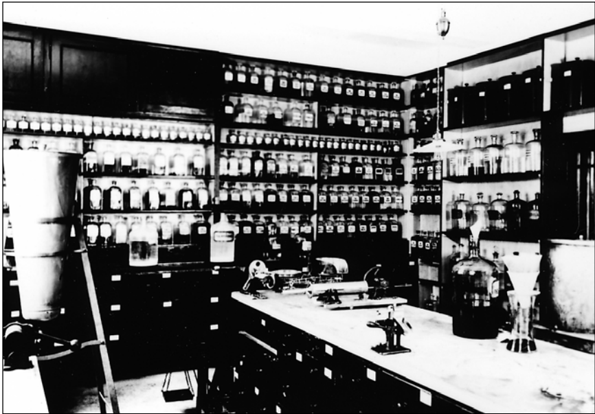
The interior of the pharmacy premises between the World Wars.

Unutrašnjost ljekarničkih prostora između dvaju svjetskih ratova