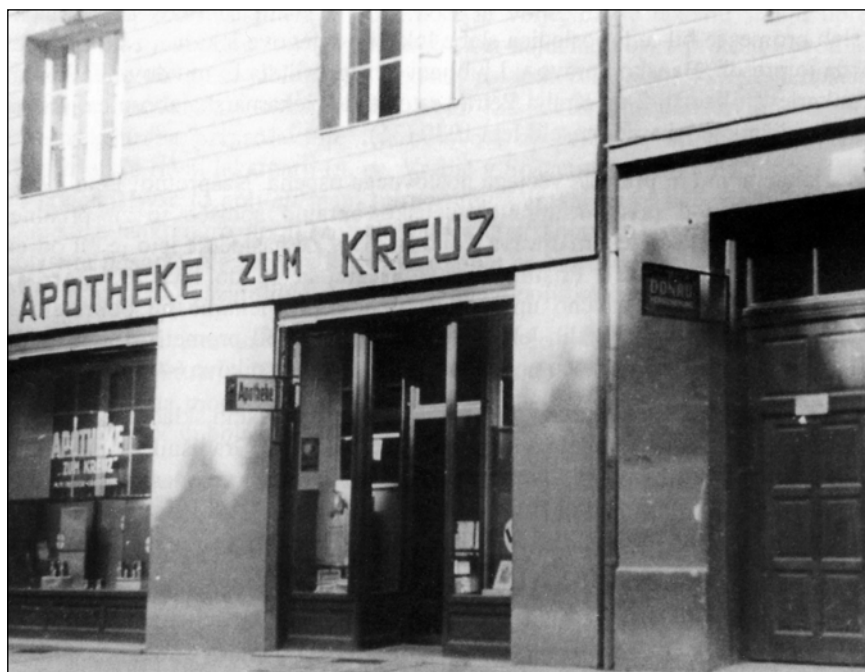
Pharmacy Pri križu from the period between the World Wars.

Reklama za lijekove iz razdoblja između dvaju svjetskih ratova