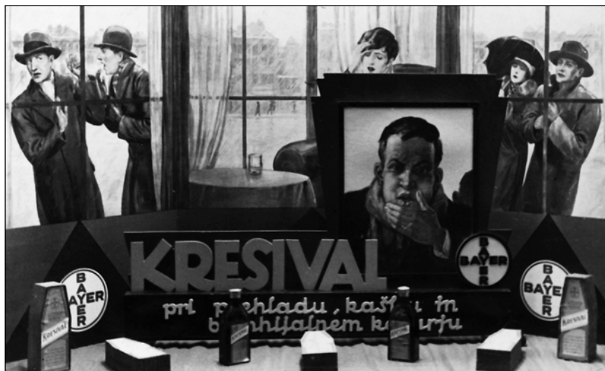
Medicine advertisement from the period between the World Wars.

Reklama za lijekove iz razdoblja između dvaju svjetskih ratova