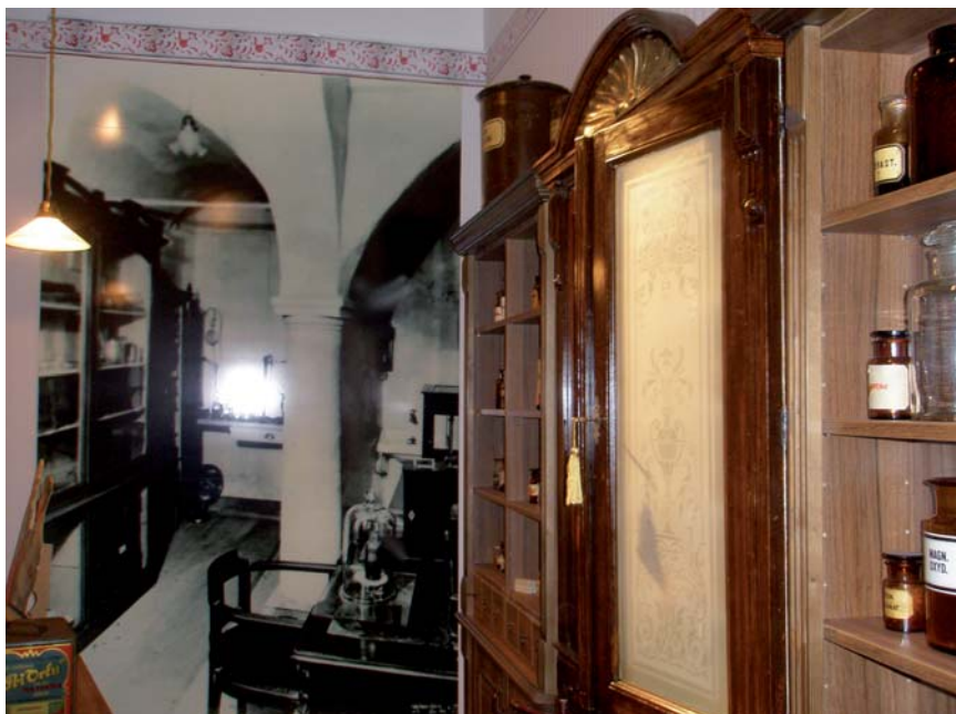
Pharmacy at the permanent exhibition "Living in Celje". Ljekarna na stalnoj izložbi Živjeti u Celju.