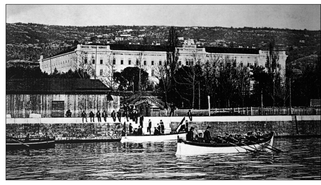
Student training on boats in front of the Royal and Imperial Navy Academy.