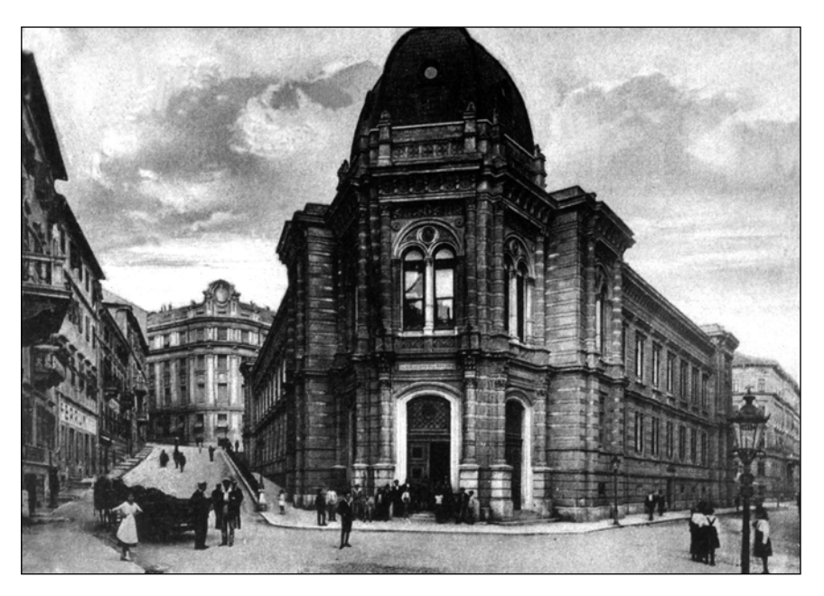
Male elementary school building (Scuola cittadina maschile) which hosted the Society's lectures, around 1910.

Zgrada Osnovne škole za dječake (Scuola cittadina maschile) oko 1910., u kojoj su se održavala predavanja Društva.