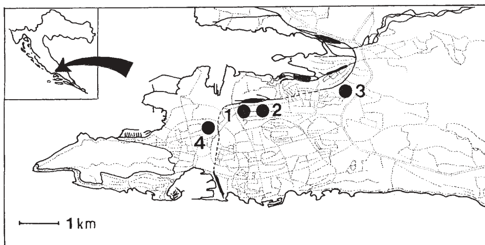
Fig. 2. Distribution of Chenopodium multifidum in Split (Croatia); the numbered dots refer to collecting sites (see text).

The records of Chenopodium multifidum from the former Yugoslavia, cited by JALAS & SUOMINEN (1980:17), GREUTER et al. (1984) and AKEROYD (1993:113) refer to the locality Vranjina in southern Montenegro (UOTILA, 1980:66) and not to Croatia. Chenopodium multifidum has not previously been recorded in the Croatian flora, and finds of it are being reported here for the first time. The plants were found in the northern part of the town of Split, mainly in the industrial zone near the northern harbour. Chenopodium multifidum was collected at the following localities (Fig. 2):