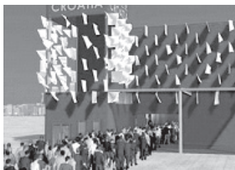
Hrvatski paviljon, poklon je domaćina