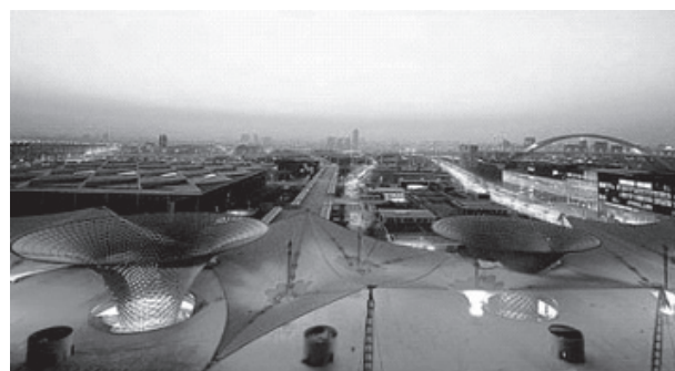
Šangaj je grad ČUDO, EXPO i noću nevideni spektakl