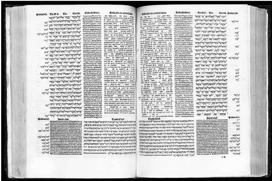
Biblia Polyglotta Complutensia

provided a strong impulse for the renewal of the Latin language. 7