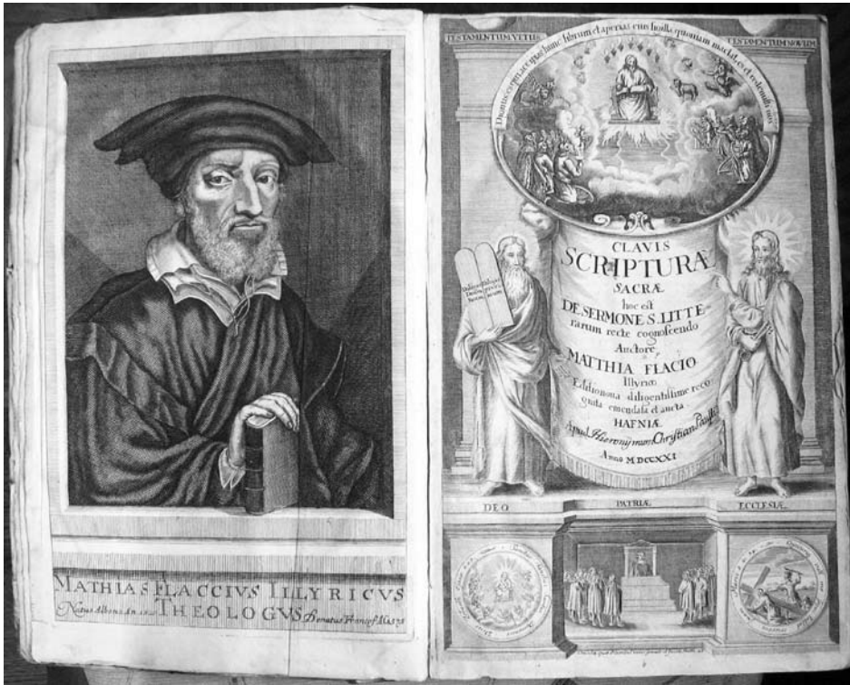
Clavis Scripturae Sacrae ( A Key for the Scripture) of Matthias Flacius Illyricus (Hafniae, 1721). The first part of the book includes Flacius' discussion on the biblical model for expression, as well as a complete review of biblical names, concepts, words and terms. The second part includes seven discussions, with the emphasis on those that speak on the interpretation of the Scripture. This work was used for years as a foundational manual for understanding of the whole Bible. It was printed in several editions.

proclaim the Word of God. Therefore, in his Small Catechism , intended for use in families, Luther particularly explains the way a father should teach and train his children and servants in the faith in God, as well as in the knowledge and keeping of the Word of God. 40