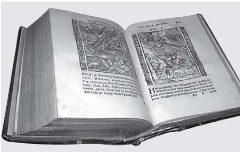
Prvi i drugi del Novoga Testamenta (First and Second parts of the New Testament) , Cyrillic script, 1563. Format 14.5 x 19.5 cm.