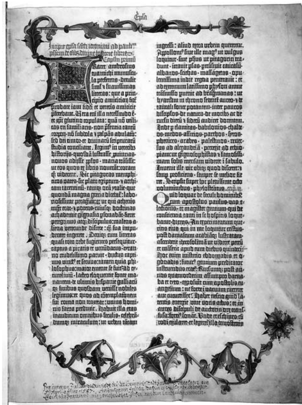
Gutenberg's Bible , completed in 1455, Latin Bible on 1,282 folios in two columns of 42 lines, in 100-200 (180?) copies printed, partially on paper, partially on vellum, ("Bible of 42 lines").