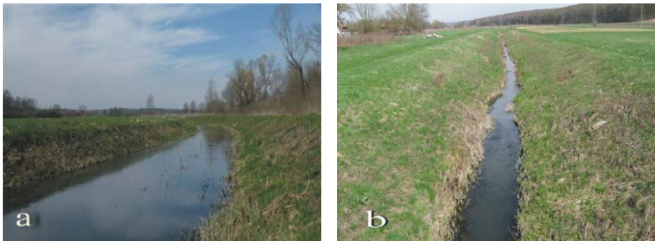
Fig. 2. Streams (a) Velika; (b) Bjelovacka

In these samples we collected 33 specimens of I. dubia larvae (Tab. 2) which have been deposited in the collection of caddisflies in the Central Water Management Laboratory of the 'Hrvatske vode'.