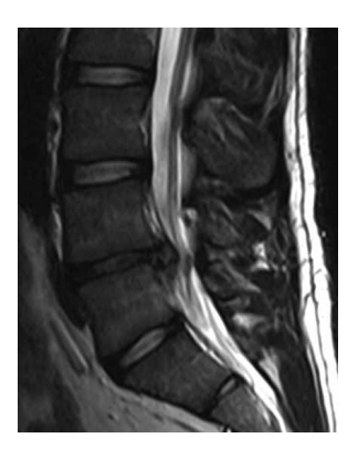
Fig 2. Preoperative MRI shows disc hernia with accompanying degenerative changes of intervertebral segment.

From 22 patients, in 15 (68.2%) fusion was demonstrated on standard X-ray of lumbar spine. In 4 patients