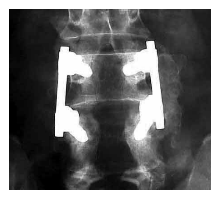
Fig 5. Bilateral transpedicular fixation and posterolateral fusion.

with deteriorating clinical presentation CT was made which showed signs of fusion in 2 cases (Figure 3), while in 2 others pseudoarthrosis was diagnosed (Figure 4), which was later settled by bilateral transpendicular fixation with larger diameter screws and posterolateral fusion (Figure 5). Signs of fusion were present in 17 (77.3%) patients. The average blood loss was 250 ml and there was no need for blood restitution, and average duration of the procedure was 135 minutes. There were no signs of lyquorrhoea or infection during or after surgery. In one patient signs of transient paresis of femoral nerve occurred which disappeared within several days.