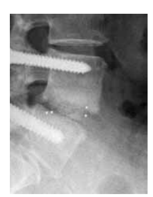
Fig 4. CT after 6 months reveals signs of pseudoarthrosis.