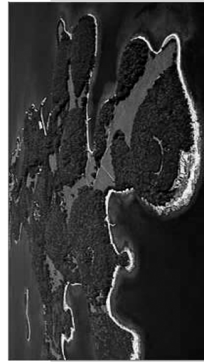
National Park Brijuni