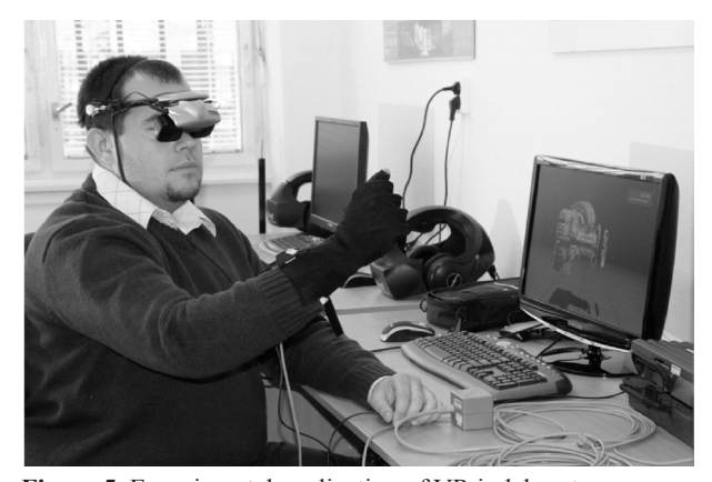
Figure 5. Experimental application of VR in laboratory Slika 5. Eksperimentalna primjena VR u laboratoriju

Virtual manufacturing includes the fast improvement of manufacturing processes without drawing on the machines' operating time fund. It is said that Virtual Manufacturing is the use of a desktop virtual reality system for the computer-aided design of components and processes for manufacture [16]. Example of application