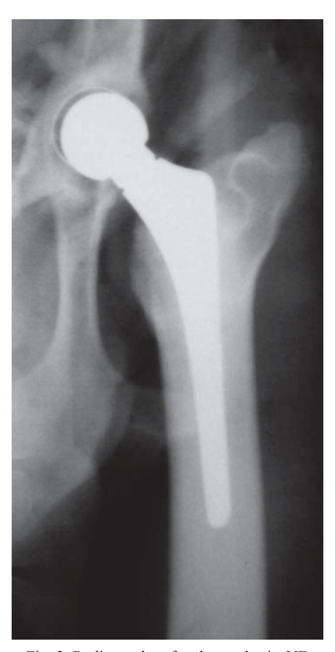
Fig. 2. Radiography of endoprosthesis: VD projection, 6 months after operation