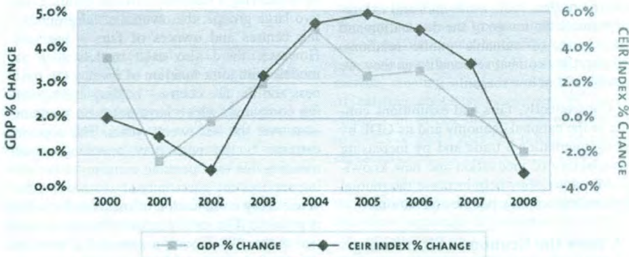
Chart 1: GDP and CIER INDEX trend in USA