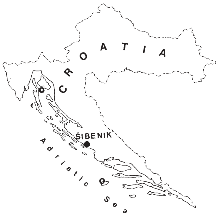
Fig. 4. The localities of the species Solanum elaeagnifolium Cav. in Croatia ● = localities described previously; ● = new localities

tion area in the past, the seaport of Šibenik and other settlements of this country are abundant in neophytes from both American continents (americanoneophytes, americanoneotophytes; TRINAJSTIĆ, 1975; 1977).