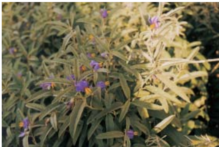
Fig. 3. Solanum elaeagnifolium Cav.

Within Croatian flora Solanum elaeagnifolium Cav. was previously known from the Plavnik islet and the island of Vis (Fig. 4). The appearance of this species and its rapid expansion within the Šibenik region (Donje polje) indicate that the species spreads thanks to the human factor (anthropochorically). Having been an emigra-