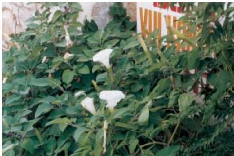
Fig. 2. Datura innoxia Miller