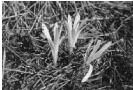
Sternbergia colchiciflora Waldst. & Kit. var. dalmatica Reichenb.