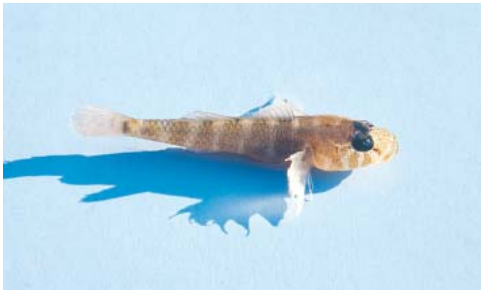
Fig. 2. Gammogobius steinitzi , female, 26,2 + 5,2 mm, Vrbnik, island of Krk, Croatia, October 16, 1998.

gin 32.1 and 31.5; caudal peduncle 24.8 and 25.0; D1 base 15.7 and 14.9; D2 base 23.3 and 23.4; A base 17.6 and 16.9; C 19.9 and 20.2; P 21.8 and 22.3; V disc 22.9 and 23.0; body depths at V origin 20.2 and 21.4; at A origin 16.0 and 17.3; body width at A origin 12.2 and 12.1; depth of caudal peduncle 9.5 and 10.1; pelvic origin to anus 21.8 and 22.6; as percentage of caudal peduncle length, caudal peduncle depth 39.7 and 40.3; as percentage of head length, snout 31.0 and 31.7; eye 25.0 and 24.1; post-orbital length 44.1 and 44.3; cheek depth 16.7 and 17.7; head width 69.1 and 65.8; as percentage of eye length, interorbital width 14.3 and 15.0.