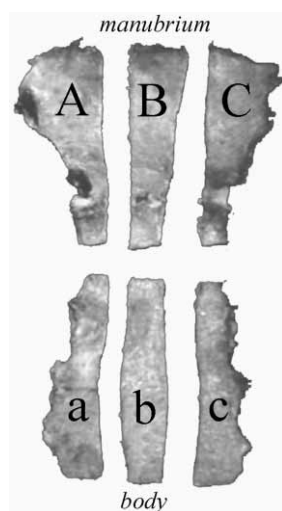
Fig. 1. Division of the sternum into segments, A – central part of the manubrium, B and C – lateral parts of the manubrium; a – central part of the body, b and c – lateral parts of the body.

According to Table 1 the central parts of both the manubrium and the body of the sternum have greater density than lateral parts, while there are no statistically significant difference in density of central parts of the manubrium and the body as well as in density of lateral parts of the manubrium and the body. Analysing the density of the sternum in general we concluded that there is great variability of density between individual samples. The density varies between 0.108 g/cm 3 and 0.438 g/cm 3 . It is evident that the maximum value is four times greater than the minimum value.