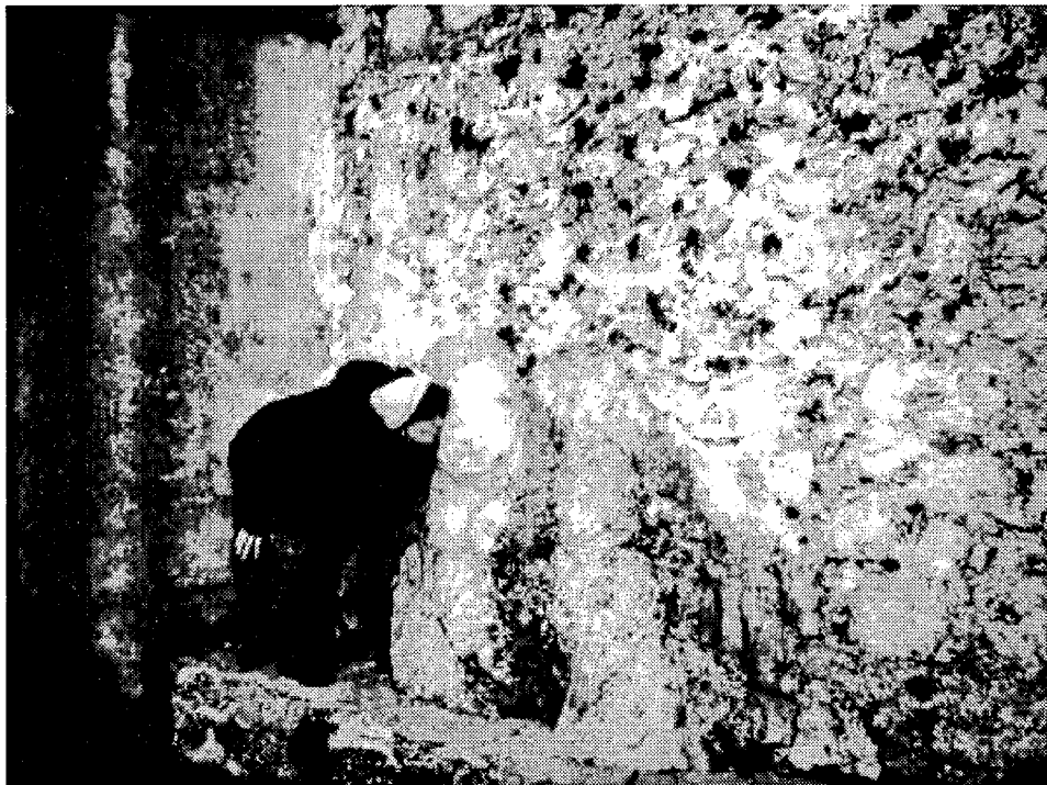
The Grobnik Baba (photo: April, 1994)

I have evidence about threatening children with having to kiss a baba on the way to Trieste from Vodice on Čićarija in Istria. Here, however, the folk legend about kissing the old woman is somewhat different. Namely, when people used to go from Vodice to Trieste by cart loaded with their products (cheese, coal etc.) they took children with them sometimes here too scaring them that they would have to kiss an old woman's arse (staru babu v rit cekit) before getting to town. In this case first the tradition and then the legend about kissing a stone baba was transferred to an imagined old woman with the obligatory lascivious folk addition. Here, too, kissing the baba is only retained in legend and reduced to threatening children. Might we state or hypothesize that this legend was preserved in the form of threatening children as part of the process of dying or transformation of a certain tradition that is preserved in the form of legend at the moment when its meaning and its purpose is lost? Thus, a living tradition is transformed into a legend incorporated into children's folklore. It is well known that in ethnology children's folklore often has this function.