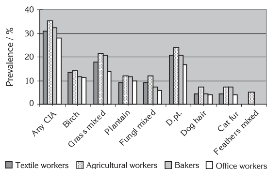
Figure 2 Prevalence of sensitisation to CIA in textile and agricultural workers, bakers, and office workers. CIA: common inhalant allergen; D. pt.: Dermatophagoides pteronyssinus

EIB prevalence is expressed as the percentage and the number of subjects affected ; mean fall index FEV 1 as means with standard deviations. EIB: exercise-induced bronchoconstriction; FEV 1 : forced expiratory volume in one second; ECT: exercise challenge test.