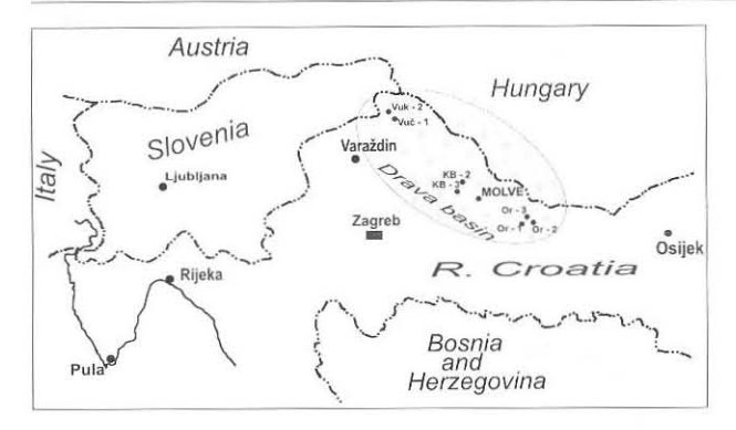
Fig. 1 Area of investigation; shaded areas are hot spots which refer to the lower part of the Late Miocene.

(JELIĆ, 1987; ČUBRIĆ, 1993). The locations Velika Ciglena, Lopatinec and others can be classified within this system. The third one is the geopressured reservoir recognized over the whole area, and which will be discussed in more detail.