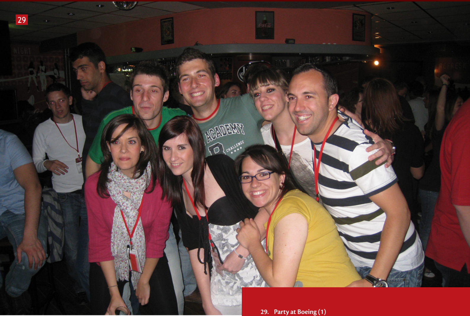
29. Party at Boeing (1)