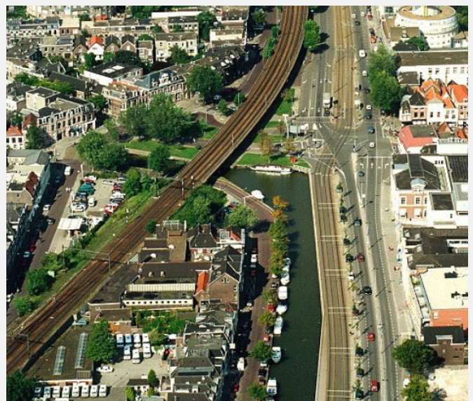
FIGURE 1. Overview of a part of Spoorzone

The Netherlands have one of the highest population densities in the world, which creates a constant need to improve the transportation infrastructure in the country. Currently, a very large infrastructural work is being undertaken in Delft known as Spoorzone Delft (figure 1). The most significant part of this project is a four track railway tunnel, which will replace an existing two track viaduct. There are many concerns with its construction in a highly populated area near the historic centre of the city. Tunnel building is difficult in the area, because of the presence of ancient building foundations, combined with soft unconsolidated soils and the large impact of groundwater pressure fluctuations. Proper monitoring is crucial to detect any situation that may arise, and prevent a catastrophic event. PSInSAR is a technology which has the potential to become a watchman for large projects such as this one. Radar is virtually always