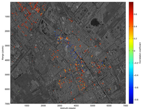
FIGURE 4. Correlation between thermal expansion and radar measured deformation for points over 17 meters over the ground in the descending orbit

PS points were classified using a soil map of Delft. From statistics calculated for each soil class, it was possible to conclude that the layers containing clay had a high deformation rate, while sand had a small deformation rate. It was concluded that the deformation measured with PSInSAR was consistent with the soil mechanics theory.