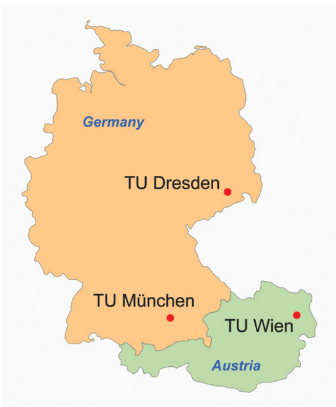
FIGURE 2. Participating universities in the international master Cartography & Geoinformatics

Beside a university program, cartography Bachelor programs are offered by five universities of applied sciences, or "Fachhochschulen (FH)". The Master programs provided by these universities of applied sciences are either in geoinformatics or in geoinformation. Within nine geodesy and geoinformation programs offered by universities of applied sciences, specialization in GIS is possible.