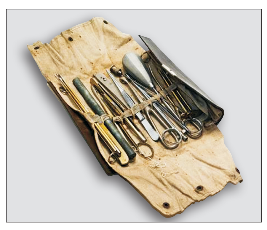
An old surgical set for veterinary application. Veterinary History Museum of the Zagreb University Faculty of Veterinary Medicine Stari tvornički pripremljen kirurški set za upotrebu u veterinarskoj medicini. Muzej za povijest veterinarstva na Veterinarskom fakultetu Sveučilišta u Zagrebu