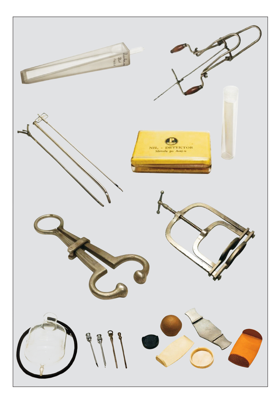
Veterinary instruments for treatment of internal diseases

Veterinarski instrumenti za upotrebu kod unutarnjih bolesti