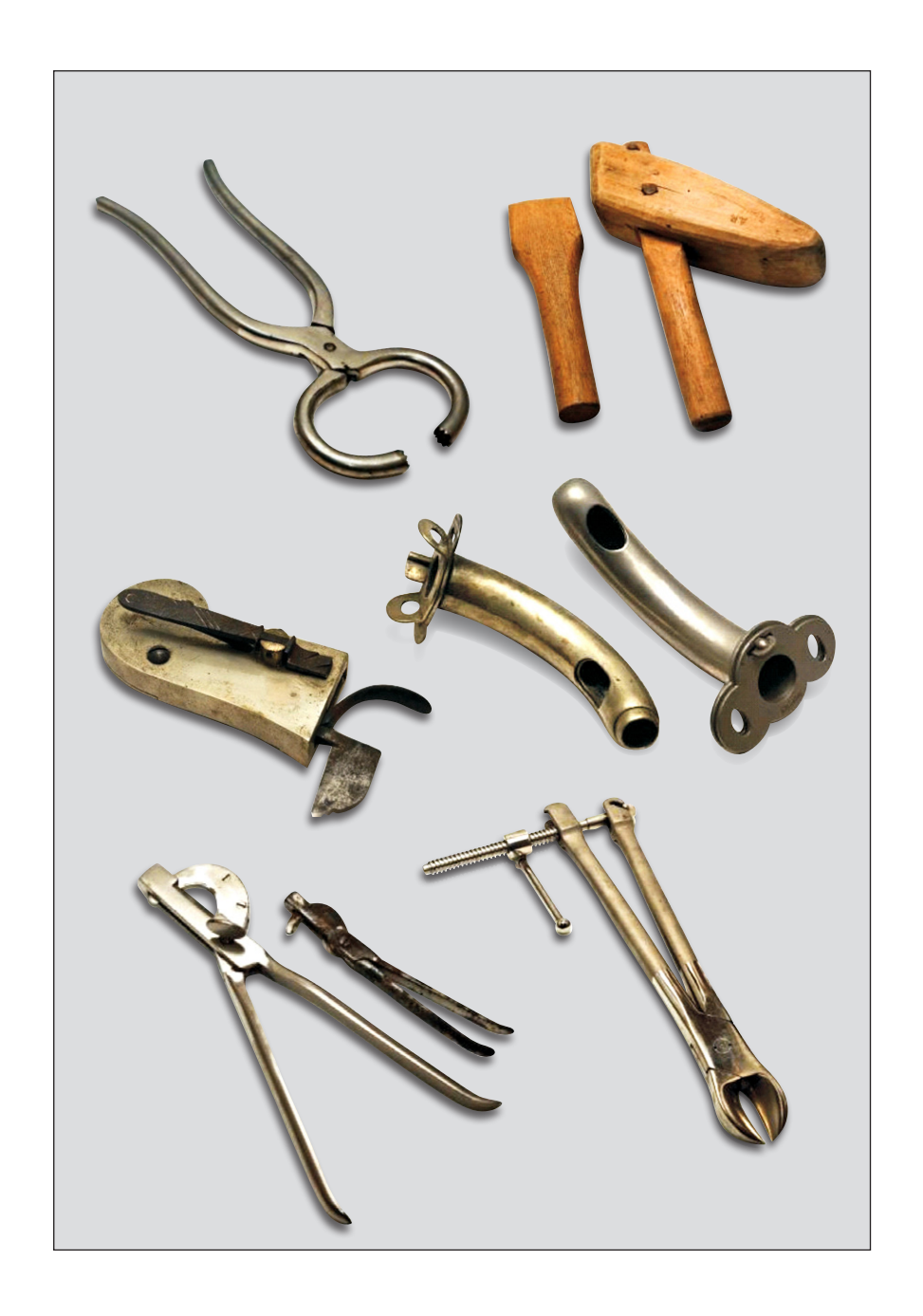
Veterinary instruments for use in surgery Veterinarski instrumenti za upotrebu u kirurgiji