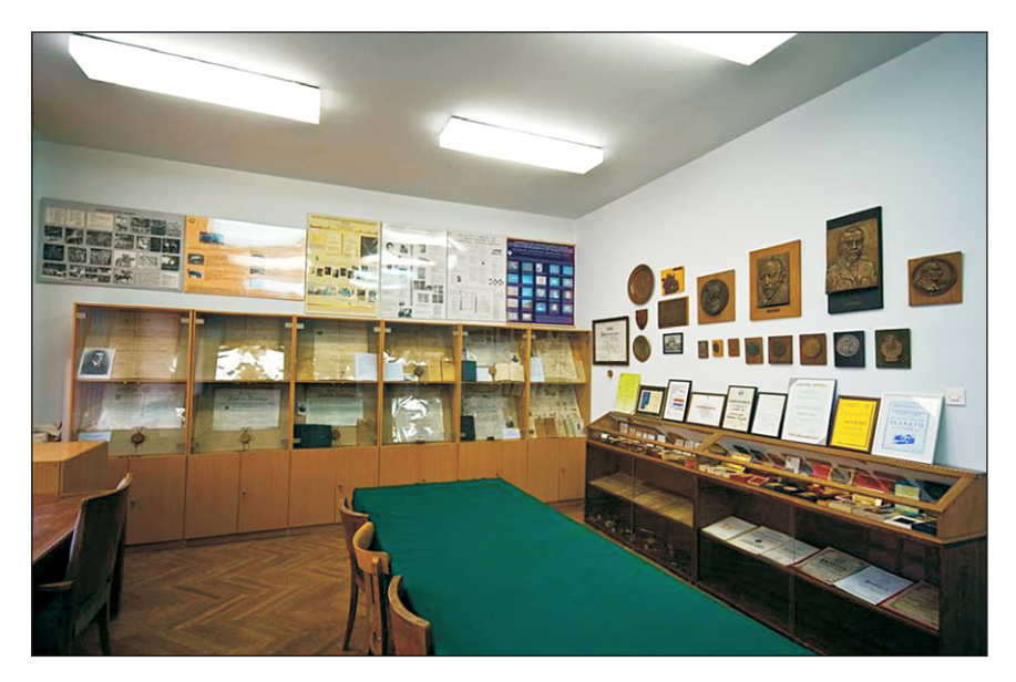
Veterinary History Museum of the Zagreb University Faculty of Veterinary Medicine

Muzej za povijest veterinarstva na Veterinarskom fakultetu Sveučilišta u Zagrebu