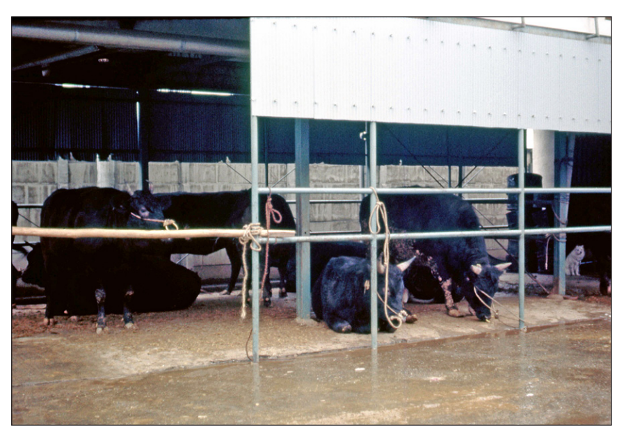
Figure 4. Black Wagyu Cattle at a farm in Kobe in 1968. Slika 4. Crno govedo vrste Wagyu na farmi u Kobe 1968.

As Japanese cows were not suitable for milk production, milk cows were imported from the USA (250 US$ per cow) and bred. By 1890, Tokyo already had 214 town farms with 2,000 milk cows. Five hundred grams of Japanese butter cost 3 Mark. Cheese was not produced because the Japanese could not stand its smell.