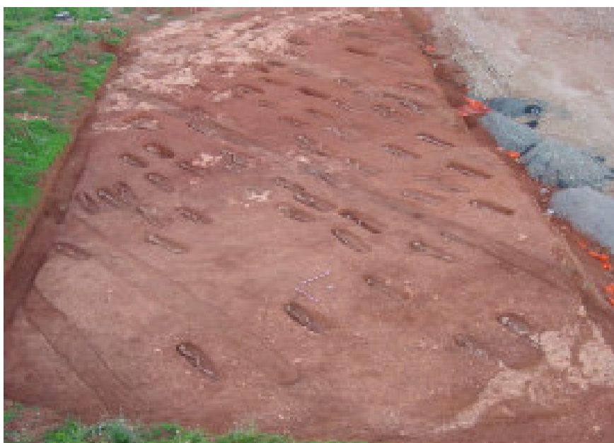
Figure 1. Aerial view of the excavation in progress.

The raw database from the site containing non-metric variables, were placed into a Macintosh program called Numbers. The frequency of each trait, for each individual tooth, was scored by the following procedures: absent [0]; present [1]; unobservable score [9]. Data was imputed into SPSS 17 (Statistical Package for Social Sciences), in order to assess relationships within the dentition statistical analyses where appropriate (see 1).