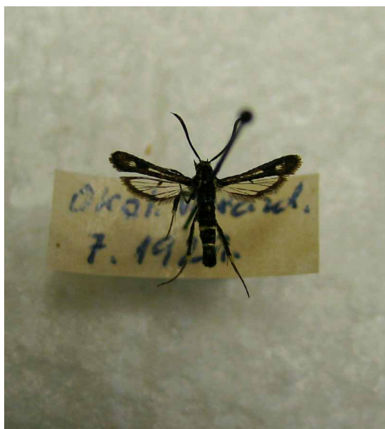
Fig. 2. Chamaesphecchia nigrifrons (Le Cerf, 1911) (coll. Koščec), an often overlooked species.

Caska (otok Pag), 1♂♀, 21.6.1960. (det. as Synansphecchia muscaeformis ), 3♀, 28.6.1960. (det. as S. muscaeformis ), 1♂, 4.7.1960. (det. as S. muscaeformis ), 1♂, 29.6.1962. (det. as S. muscaeformis ), leg. M. Mladinov, 1♂, 5.7.1960. (det. as S. muscaeformis ), leg. Magerle, Dubrava (otok Pag), 1♂, 7.1962. (det. as S. muscaeformis ), leg. K. Igalffy, ex coll. Igalffy, Zagreb, 1♂, 6.7.1929. (det. as S. muscaeformis ), 1♂, 17.7.1929. (det. as S. muscaeformis ) 1♂, 1.7.1929. (det. as S. muscaeformis ), ex coll. Valjavec (CNHM); Varaždin, 1♀, 31.7.1925., 1♀, 2.8.1925., 1♀, 23.7.1928., 1♂, 26.7.1928. (det. as Chamaesphecchia empi-