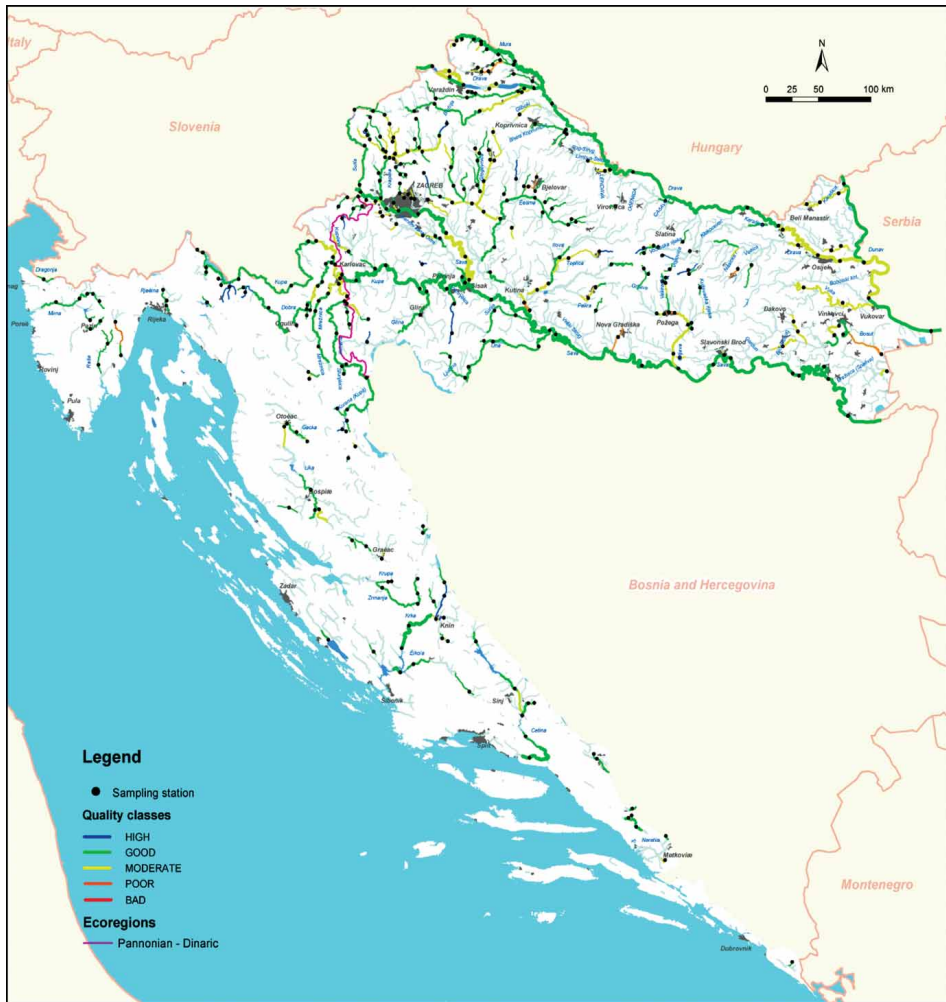
Fig. 2. Cartographic overview of saprobic status of running waters in Croatia based on benthic macroinvertebrates (five classes, acc. to WFD EU).

The objective of the WFD EU for the member states, but also for the Republic of Croatia is the attainment of at least good water status on every water body.