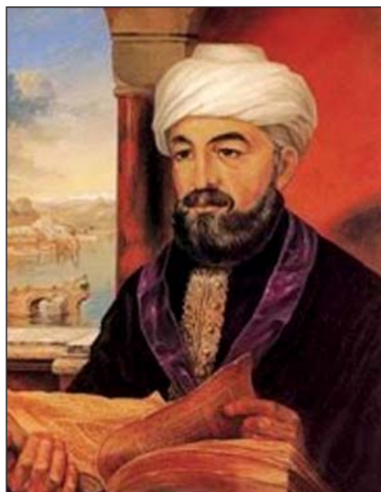
Moses Maimonides (1138-1204)