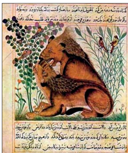
Ibn Bakhtishu's Manafi' al-Hayawan dated 12th century. Captions appear in Persian language.

Naslovnica Maimonidesova djela « Vodič za zbunjene» prevedemog s arapskog na hebrejski 1347. Kraljevska knjižnica, Kopenhagen, Cod. Heb. 37.