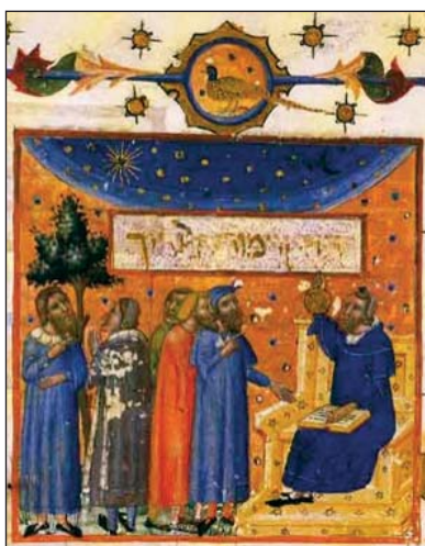
The titlepage of Maimonides' work Guide of the perplexed, translated from Arabic into Hebrew in 1347. Royal Library, Copenhagen, Cod. Heb. 37.

Naslovnica Maimonidesova djela « Vodič za zbunjene» prevedemog s arapskog na hebrejski 1347. Kraljevska knjižnica, Kopenhagen, Cod. Heb. 37.