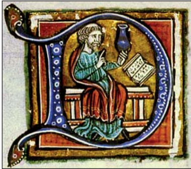
Hunayn Ibn Ishaq (Johannitius, 809-873)

appealed very strongly to the Muslims, whose credo insisted upon the one and only Allah [8]. In the Sura of Unity, the Quran states that “Allah begat not, nor was he begotten”, with which the Nestorian doctrine seemed to agree, thus set apart from other Christian infidels. By the 13 th Century, the city and its institution were reduced to nothing as a result of the earlier transfer of the medical center to the new Abbasid capital of Baghdad.