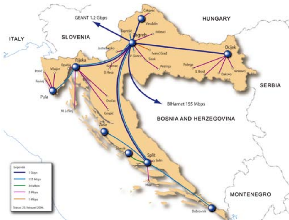
Figure 3. Croatian Academic Research Network (CARNet) communication infrastructure in the Republic of Croatia (status on October, 2006). CARNet is the government body, within the system of science, higher education, and technology. CARNet network/web is used by researchers, professors, students, and administrative staff of the scientific and educational institutions. CARNet web links all major Croatian cities at several levels of different technologies and access speed. The axis of CARNet web links all university centers (Dubrovnik, Osijek, Pula, Rijeka, Split, Zadar, and Zagreb) by high-speed links (ranging from 155 Mbit/s to 1 Gbit/s), whereas smaller centers are linked by modem links with 1-2 Mbit/s speed (74).

budget for the Republic of Croatia (14). It is apparent that all our investments have so far been recouped. Since 60 contracts had been signed for projects applied for in 2005, before the official status of Croatia in FP6 changed, the total number of contracts is now expected to amount to 85-90, and the total amount received from the European Commission for these projects is expected to be €7 million by the end of 2006. The 7th Framework Program will be open from 2007 to 2013 (73).