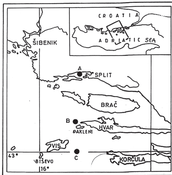
Fig. 1. Study area and sampling locations of Chromis chromis in the middle Adriatic: A = Kaštela Bay, B = Pakleni Otoci Archipelago, C = Budikovac Islet

(234 females and 172 males) were sampled from commercial catches and subjected to biometric analysis. The sample was categorized into length classes.