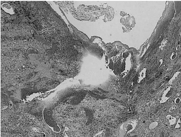
Fig. 1. Necrosis of the intestinal wall with some hemorrhage and inflammation. Hematoxylin-eosin, x200.

AdoMet: S-adenosylmethionine, AdoHcy: S-adenosyl-L-homocysteine