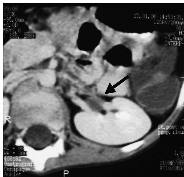
Fig. 2. Abdominal CT scan showing the dilated upper part of left ureter (arrow). Extraureteral obstruction is excluded.