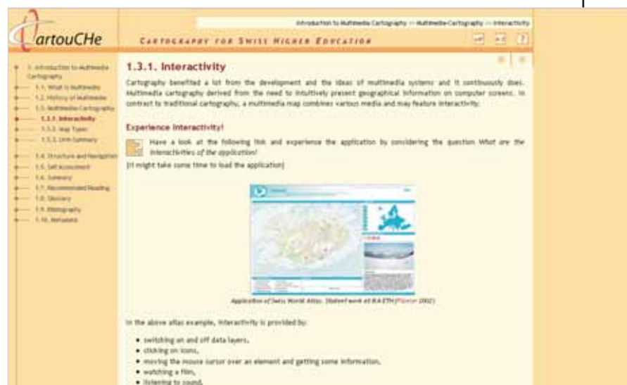
Fig. 2. Interactivity homepage Sl. 2. Početna stranica o interaktivnosti

Modul Multimedia Cartography sastoji se, u prijevodu na hrvatski, od ovih deset poglavlja: