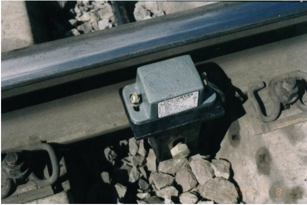
Fig. 3. Magnetic steel fixed next to the railway rail