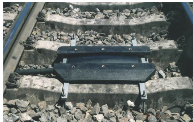
Fig. 2. RF Reader fixed between two railroad ties