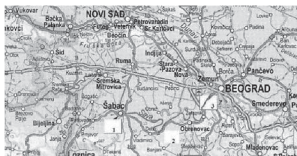
Figure 1 The three sampling locations along the Sava River: Šabac (L1); Obrenovac (L2); Beograd (L3)

Water and sediment samples were collected between 2005 and 2009 at six-month intervals to cover both the dry (autumn) and wet (spring) seasons. Water samples intended for microbiological analysis were taken early in the morning at about 50 cm below the water surface and placed into sterile 250-mL bottles. The bottles were kept cold in ice-packed cooler boxes and returned to the laboratory for analysis on the same day they were collected. For the analysis we used the spread-plate method. All samples were tested for total bacteria count, total coliforms, faecal coliforms, and E. coli . Bacterial colonies were counted after incubation on the surface of plastic plates filled with nutrient agar and directly inoculated in serial diluted river water onto each plate. Total coliforms (TC) and E. coli were scored using the most probable number (MPN) method (6, 7) and inoculated into a series of five tubes containing Lauryl tryptose broth (Torlak Institute, Belgrade, Serbia) and Endo agar at 37 °C for 24 h. Gram-negative bacteria were scored as faecal coliforms (FC). Samples of total FC were inoculated onto incubation plates with MacConkey agar (Difco, Detroit, USA) at 37 °C for 24 h. The plates for thermo tolerant FC were incubated at 44 °C for 24 h (7).