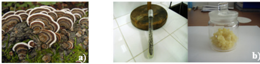
Fig. 1. White-rot fungi a) Trametes versicolor in the nature (Singh, 2006), b) Trametes versicolor G-99 in the laboratory, from spores to mycelial pellets

comprising mostly of basidiomycetes and litter-decomposing fungi (Wesenberg et al., 2003).