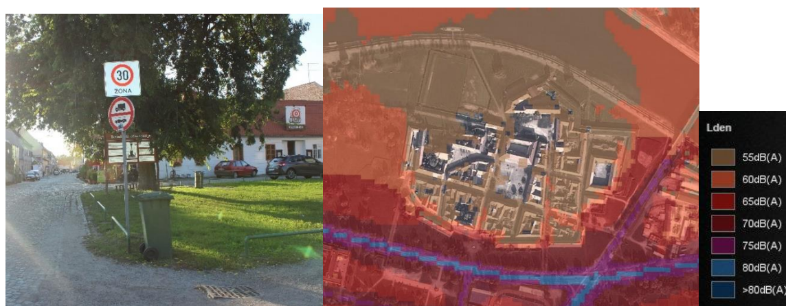
Figure 5 a) Noise abatement measures and b) noise levels in Tvrd̄a

Noise has been reduced in some parts of the city through other measures not focused on noise reduction, such as speed limits, traffic bans on certain types of vehicles, and suitable urban planning. For example: the streets in the old part of the city, Tvrd̄a, are paved with small stone cubes, which can generate considerable noise. Noise has been limited here through several measures introduced because of safety, pavement structure, and capacity. Some of the traffic areas, along with a central square, have been turned into pedestrian-only zones, while in other parts the car speed has been limited to 30 km/h and trucks and heavy vehicles have been prohibited (Figure 5, left). The high noise levels of European Avenue, located south of Tvrd̄a, have been attenuated by a green belt, but they have been reduced more so by the massive buildings around the perimeter. Figure 5 shows a noise map of the area, revealing the effect of these measures. It should be noted that these noise maps do not include noise from bars and clubs, though this noise can dominate on the weekends during the evening and night.