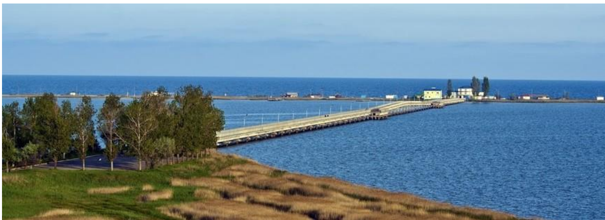
Figure 1 Pedestrian-transport bridge over the Budak estuary [12]

The Budak estuary (length, 17 km; width, 1.5 km; depth, 0.2 – 1 m) is separated from the Black Sea by a narrow (up to 150 m) sandy embankment, which is a beautiful beach used for thalassotherapy. In 1972, the pedestrian-transport bridge that is more than 1-km long was put into operation over the estuary, which connects the mainland with a sea spit. [11] (Figures 1 and 2):