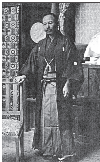
Figure 4 Ogai Mori in about 1912.