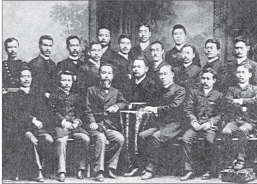
Figure 3 Ogai Mori with other Japanese students in Berlin 1888

On 16 April 1887, Mori returned to Berlin, now with a new pseudonym Ogai, and devoted himself to the study of bacteriology with Robert Koch. Occasionally he would pay a visit to pathologist Rudolf Virchow. He would also visit the Yamato-club for the Japanese residents in Berlin (Fig. 3). On 17 July, his chief of staff from the ministry of war came to Berlin. Mori accompanied him as a translator and speaker on international congresses held in Karlsruhe and Vienna. From 10 March through 1 July 1888, he served as army surgeon at the 2 nd infantry regiment of the imperial guards. On 5 July he left for home, sailing from Marseille to Yokohama, where he disembarked on 8 September, bringing along a library of 450 volumes in German.