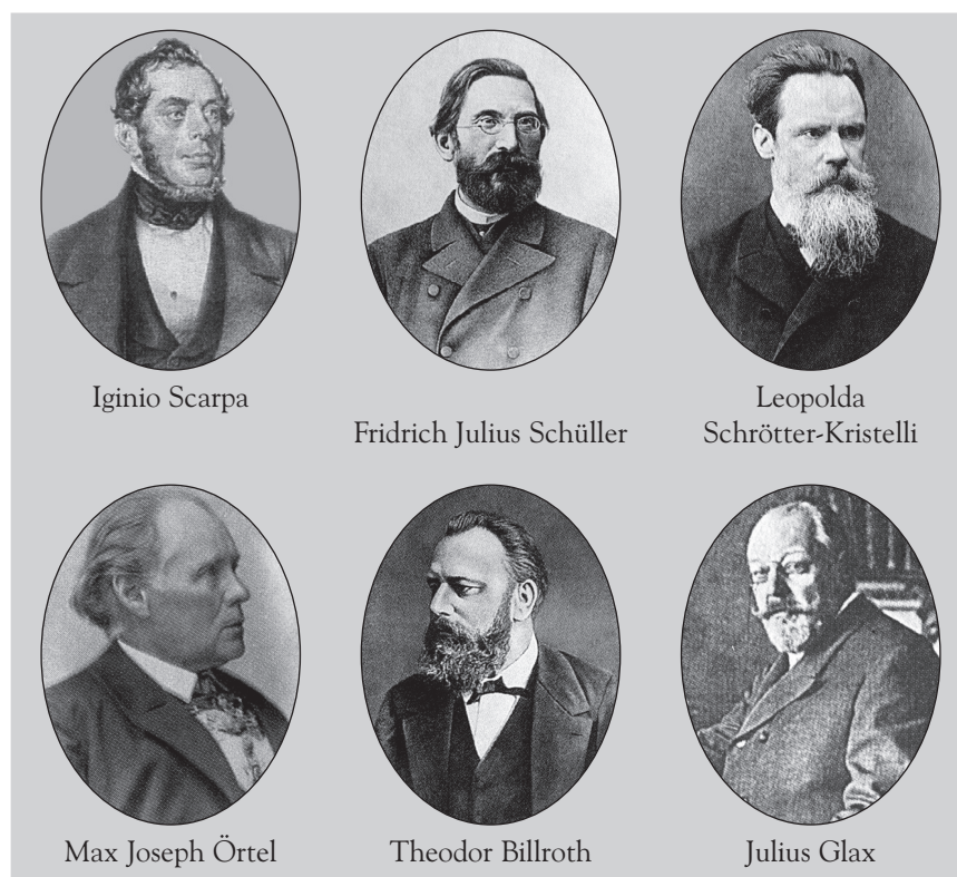
Figure 2 Advocates and promoters of Opatija as a centre of thalassotherapy