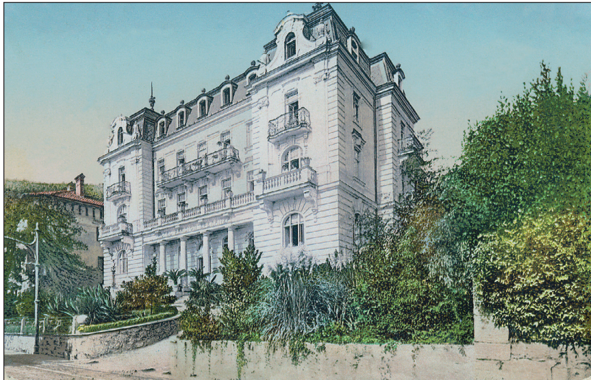
Hotel Speranza, danas Villa Dubrava, dio opatijske Thalassoterapije Former Hotel Speranza, now Hotel Villa Dubrava of the Thalassoterapia complex