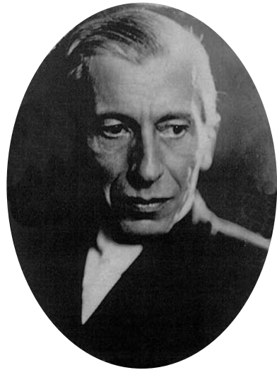
Figure 2. N.C. Paulescu in 1928.

As we mentioned before, researchers progressively realised that diabetes is much more than a disorder of carbohydrate metabolism ( diabetes mellitus ), and they stated that diabetes can be equally considered as diabetes lipidus [14] (lipid disorders being indissolubly linked to this syndrome) and diabetes proteicus due to the important protein metabolism alteration [13]. The last term, proposed in a presentation of Marliss during the IDF Congress in Cape Town in 2006, confirmed in fact the vision that Paulescu had in 1912. Despite this, at that moment no one made reference to the papers of